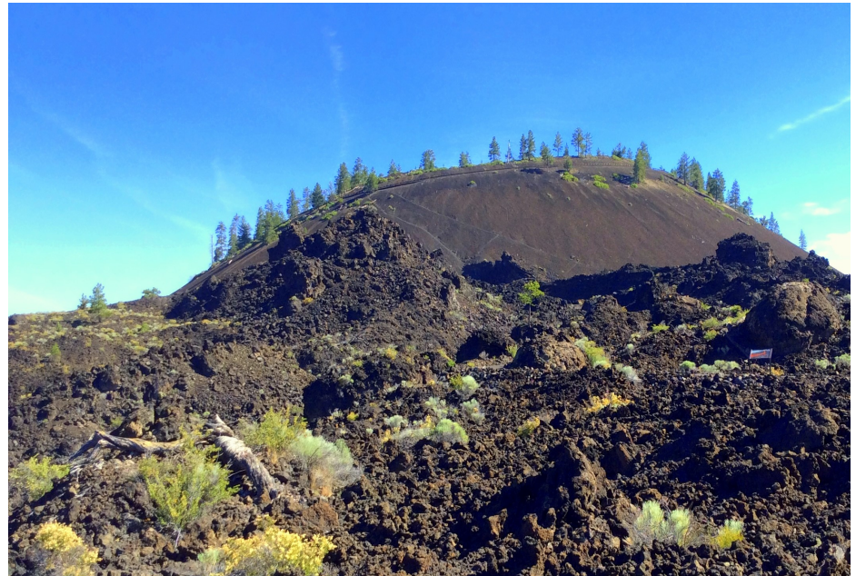
Figure 3. Lava Butte and lava flow

The Deschutes National Forest Land and Resource Management Plan (LMRP) guides all management decision on the Forest. It established overall goals, objectives, standards and guidelines. The proposed path passes through the Scenic Views Management Area (M-9). The proposed path complies with LMRP direction to provide additions or modifications to the trail system which will meet the increasing and changing demands in dispersed recreation, providing trails for all difficulty levels (LMRP 4-2, 4-32).