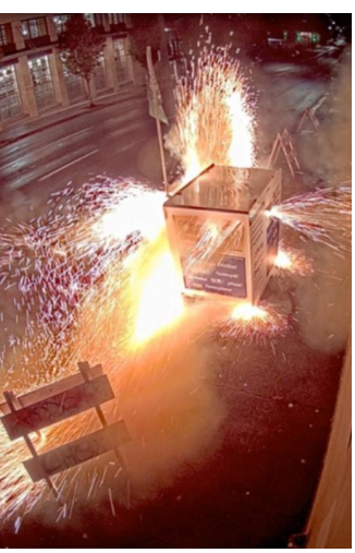
Ballot Box - Portland, Oregon